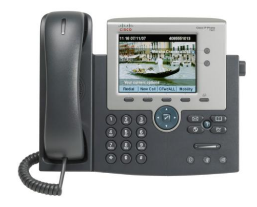
Fig.: Cisco IP Phone 7945g